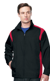
Lightweight Jacket #J1450*