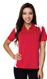
Women's Companion #143

/$29.50 | $33.50 BLANK* (P) DECORATED* (P)