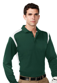
Long Sleeve #K145LS*